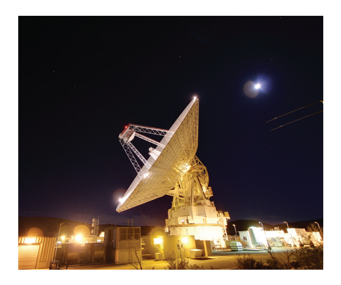
The Goldstone Deep Space Communications Complex, located in the Mojave Desert in California, is one of three complexes that comprise NASA's Deep Space Network (DSN).

Images from NASA's Chandra X-ray Observatory – a telescope in orbit around the Earth that looks at objects in space in a special type of light called X-rays —can be fascinating, informative, and beautiful. These images show our Universe in a way we could never see directly with human eyes. But the information that is eventually converted into images actually arrives at the Chandra X-ray Center in Cambridge (USA) as a stream of 1's and 0's that only a computer could understand. Fortunately, many people have worked hard to develop steps to process the data using software and technical know-how to convert them into something that humans can use and admire.