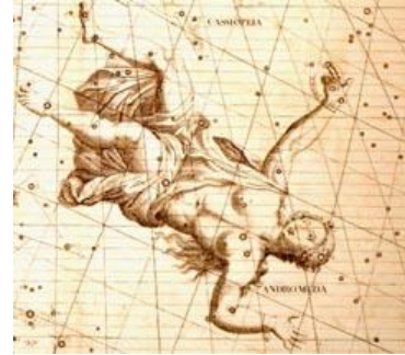
Historia Coelestis, 1725

There is controversial evidence that the British astronomer John Flamsteed observed and recorded the Cas A supernova event in his journal on the evening of August 16 th , 1680. He observed a star that was near the position of Cas A, not observed by anyone else, and was never seen again – it could have been the explosion that produced Cas A. The Cas A remnant is ~11,100 light years away, and if John Flamsteed did observe the catastrophic event years ago, the supernova occurred approximately 11,434