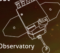
Solar Dynamics Observatory

Though some ultraviolet waves from the Sun penetrate Earth's atmosphere (and give us sunburns), most of them are blocked by various gases like ozone.