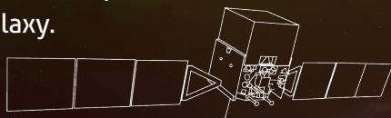
Fermi Gamma-ray Space Telescope

More typical production of gamma ray beams emanate from pulsars within the Milky Way galaxy.