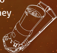
Spitzer Space Telescope

Infrared can also be used to detect protostars before they begin to emit visible light.