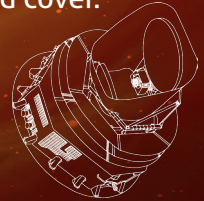
Planck Space Telescope (no longer operating)

Active microwave experiments have also been done with objects in the solar system, such as determining the distance to the Moon or mapping the invisible surface of Venus through cloud cover.