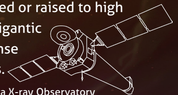
Chandra X-ray Observatory

The photons collected in space by X-ray telescopes reveal the hot spots in the Universe—regions where particles have been energized or raised to high temperatures by gigantic explosions or intense gravitational fields.