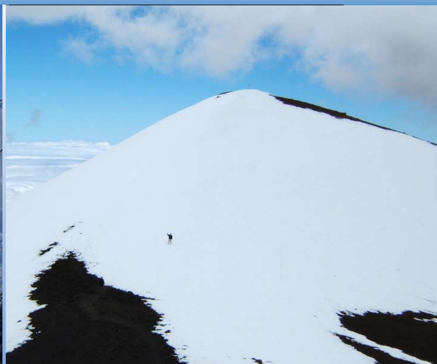
From base to peak, Mauna Kea, on the island of Hawaii, is the tallest mountain on Earth.