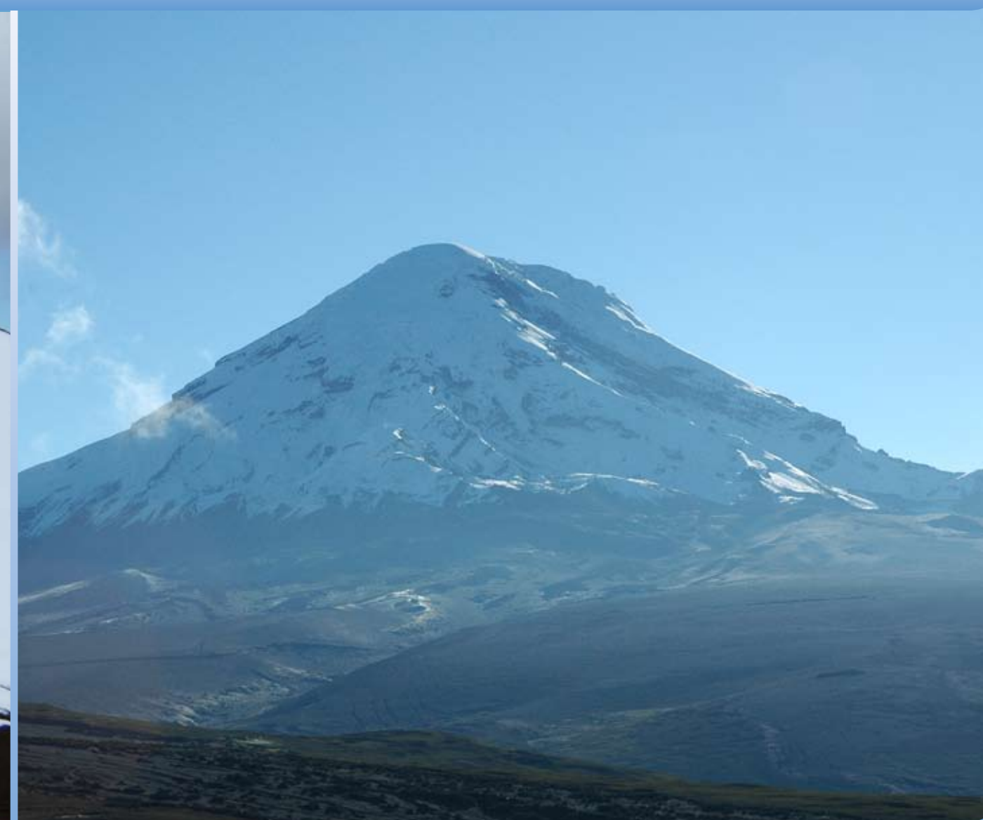
Because of its location near the equator, the peak of Mt. Chimborazo, in Ecuador, rises farther from the center of the Earth than that of any other mountain.

It might seem easy to figure out what mountain on the Earth is the tallest, but it can get confusing. What do we mean by "tall?" Do we measure the height of a mountain from sea level? From its base? From the center of the Earth? All of these are reasonable (and interesting!) ways to do it.