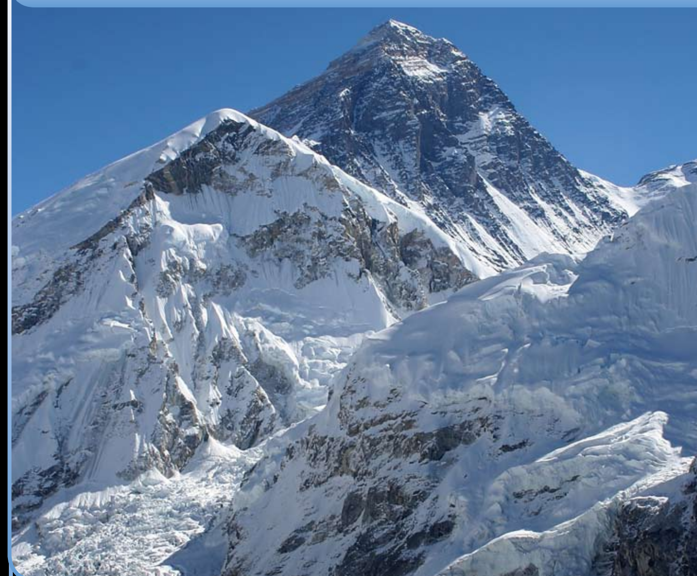
The peak of Mt. Everest, located on the border of Tibet and Nepal, is higher above sea level than that of any other mountain on Earth.