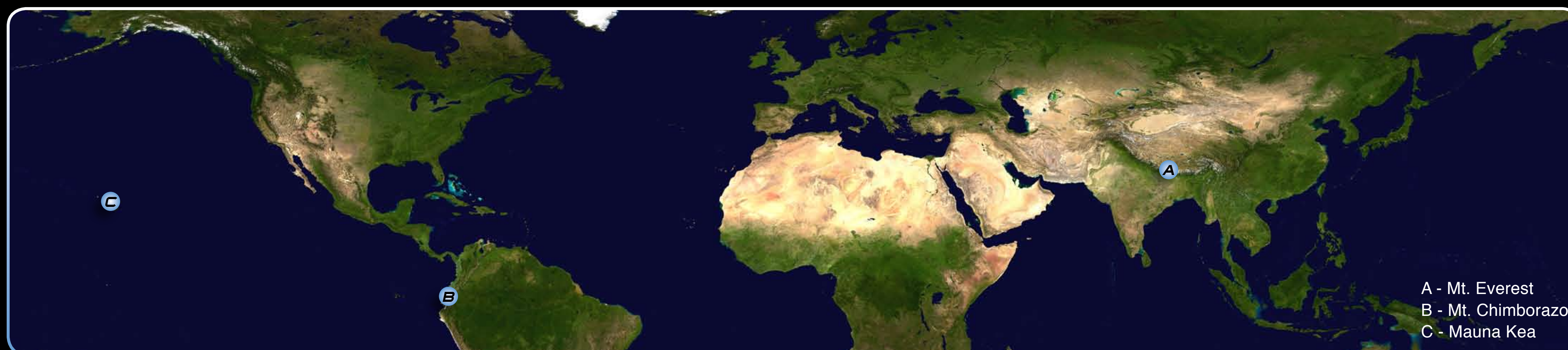
A - Mt. Everest B - Mt. Chimborazo C - Mauna Kea

Mt. Chimborazo, in the Andes of Ecuador, is 20,703 feet (6310 meters) above sea level. But, because Ecuador is near the equator, the top of this mountain is actually farther from the center of Earth than any other point on the planet!